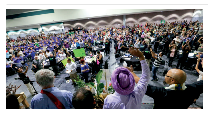
Faith in Action is the largest faith-based community organising network in the United States.